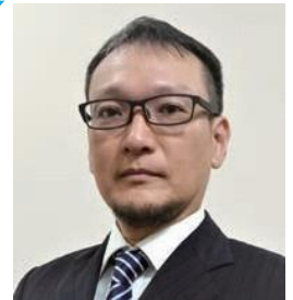
Representative Yoji Yamaguchi

Establishment : September 2012 Representative : Yoji Yamaguchi Activities : Electrical and Air conditioning Construction, Machinery Installation, Piping, Building, Engineering, Design, Trading, etc. Capital : MMK 3,634M Investment ratio : 93.4%